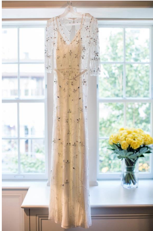
My wedding dress by Jenny Packham is known as Tuberose. The bottom layer was a formfitting slip. The tulle overlay was embellished with little beads.