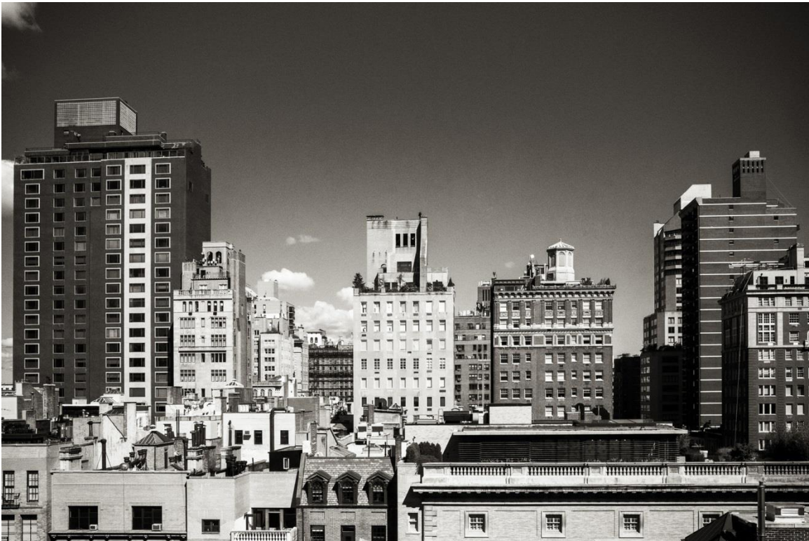
The view from the Mark hotel .