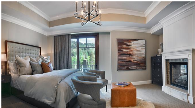
Park City, Utah. This two-bedroom, three-bathroom condo located in the Montage Deer Valley comes completely furnished by designer Barclay Butera. The apartment features crown molding, two fireplaces, and multiple balconies, and offers mountain views.