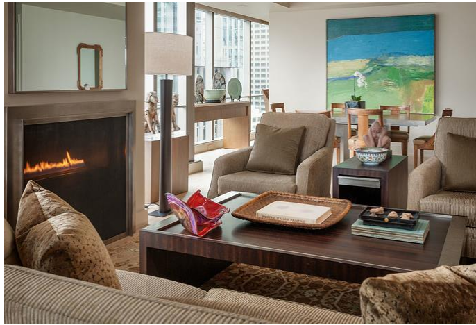
Seattle. Designed by acclaimed decorator Terry Hunziker, this two-bedroom residence is located in the Four Seasons. Interior details include custom cabinetry and floors of hardwood and stone.