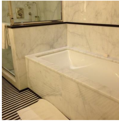
A bathtub fit for a queen....the Queen of Fashion Films!