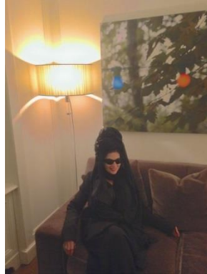
Relaxing in the sitting room, a space full of design surprises...