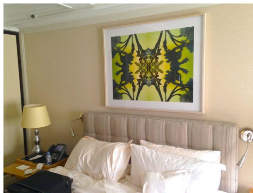
The suite's bedroom.