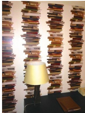
...such as this stacked-books trompe l'oeil wallpaper. Luckily, "books" were not just a design element: to the left were several bookshelves replete with a wide range of fascinating real tomes.