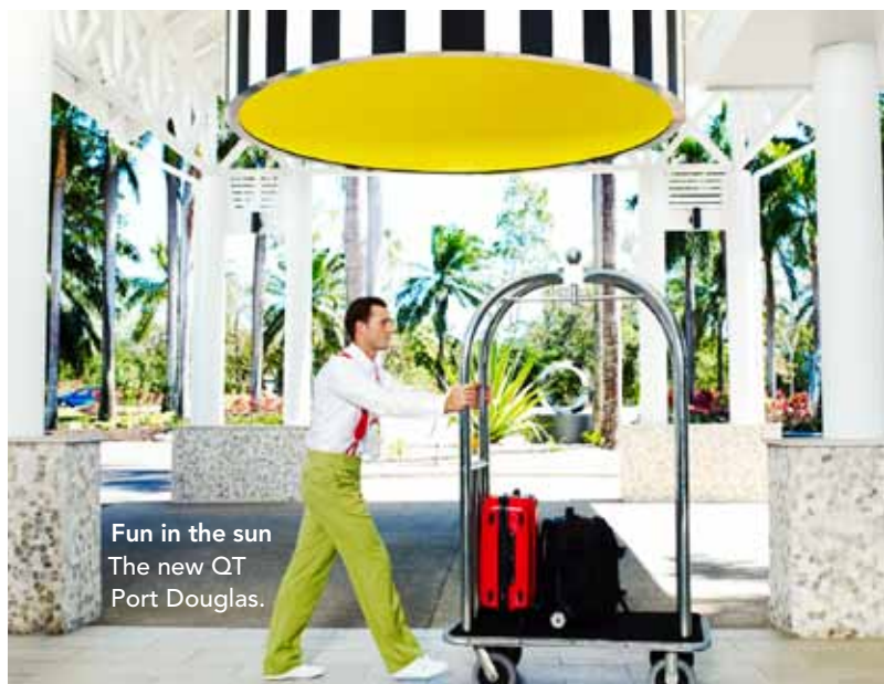
Fun in the sun The new QT Port Douglas.

Such a fresh attitude and energy bodes well for QT's next trick: QT Sydney opens next month in the former Gowings building and offices reclaimed from the State Theatre (which AHL also owns), and the story will then continue in Canberra. Stay tuned. qthotels.com.au