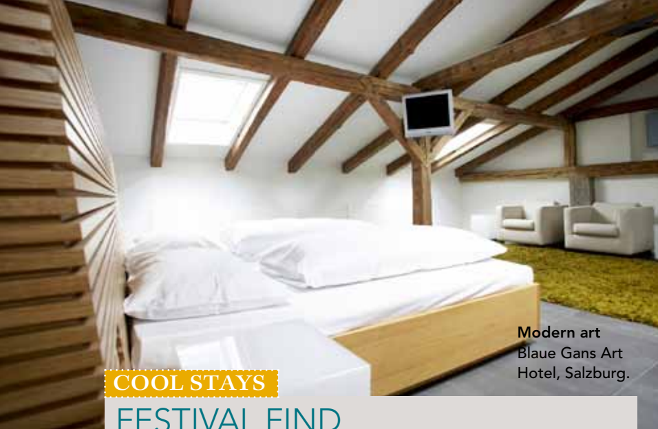
Modern art Blaue Gans Art Hotel, Salzburg.