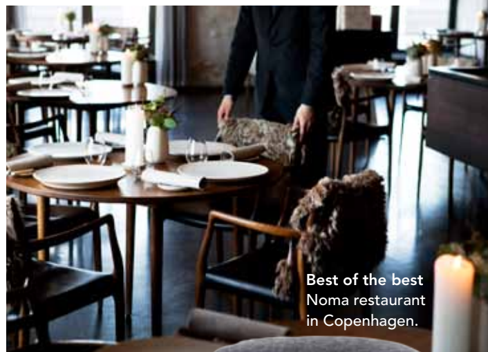
Best of the best Noma restaurant in Copenhagen.

If dinner at Noma is on the to-do list, Scandinavian specialist tour company 50 Degrees North can sort you out. They've secured a booking in the beautiful staff room (a 15-seat private room on the first floor above the restaurant, with stunning views over Copenhagen harbour) at the World's Best Restaurant on 29 August and are tailoring a luxury long-weekend package around it. The four-night package includes two nights' luxury accommodation in Copenhagen, a pass to tour the city's attractions, dinner at Noma, plus two nights in the Danish countryside at the beautiful castle Dragsholm Slot. It's the perfect opportunity for those who want to see what all the fuss is about for themselves. Priced from $2500 per person twin share, including breakfast and two additional dinners. 1300 422 821, fiftydegreesnorth.com MICHAEL HARDEN