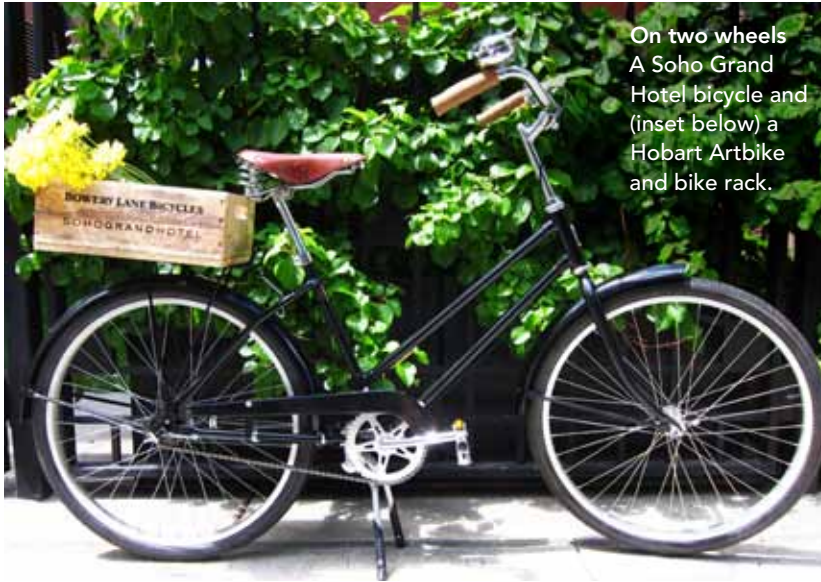
On two wheels A Soho Grand Hotel bicycle and (inset below) a Hobart Artbike and bike rack.