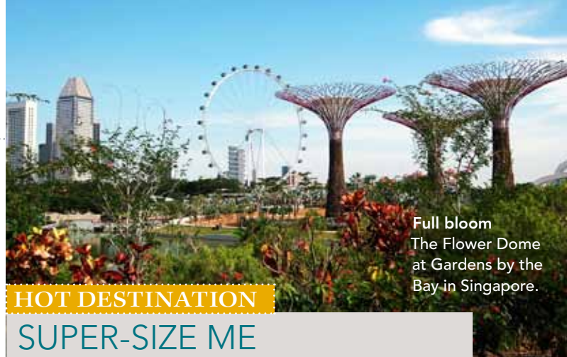
Full bloom The Flower Dome at Gardens by the Bay in Singapore.