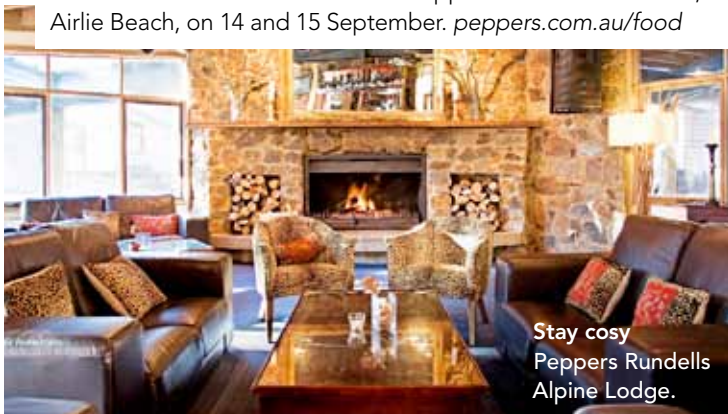
Stay cosy Peppers Rundells Alpine Lodge.